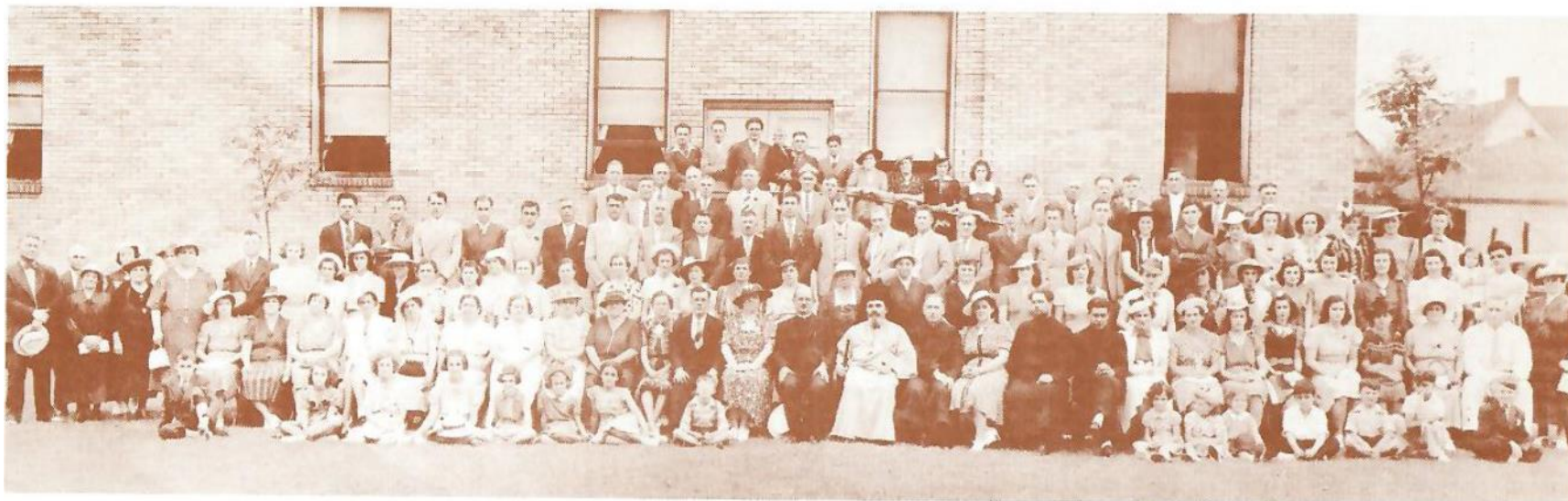
Photograph of the Congregation on the 25th Anniversary of the Parish. The Late Bishop Policarp Morusca was present at this memorable occasion.