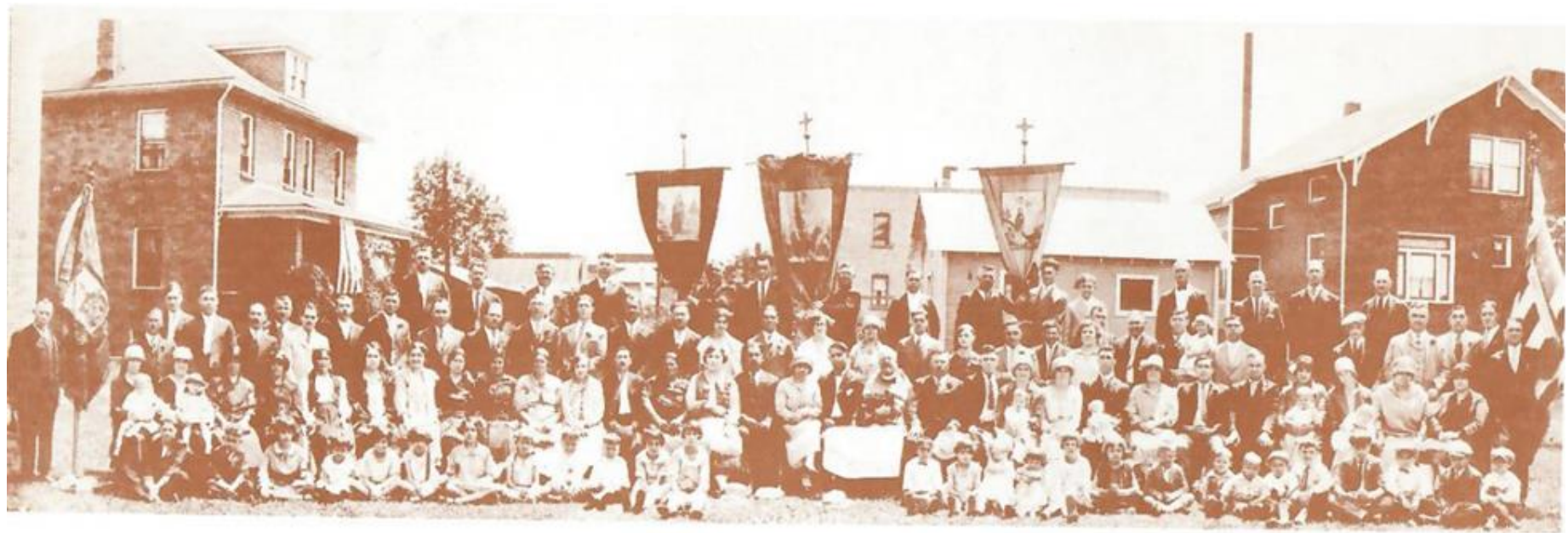
Photograph of the Congregation on the 13th Anniversary of the Parish July 4, 1927.