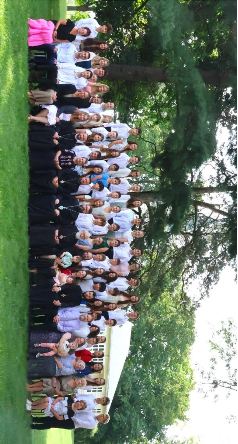
The Junior Summer Camp at Vatra Românească, Grass Lake, MI (July 20—August 2, 2025) Tabăra de Vară a Juniorilor la Vatra Românească, Grass Lake, MI (20 Iulie—2 August, 2025)