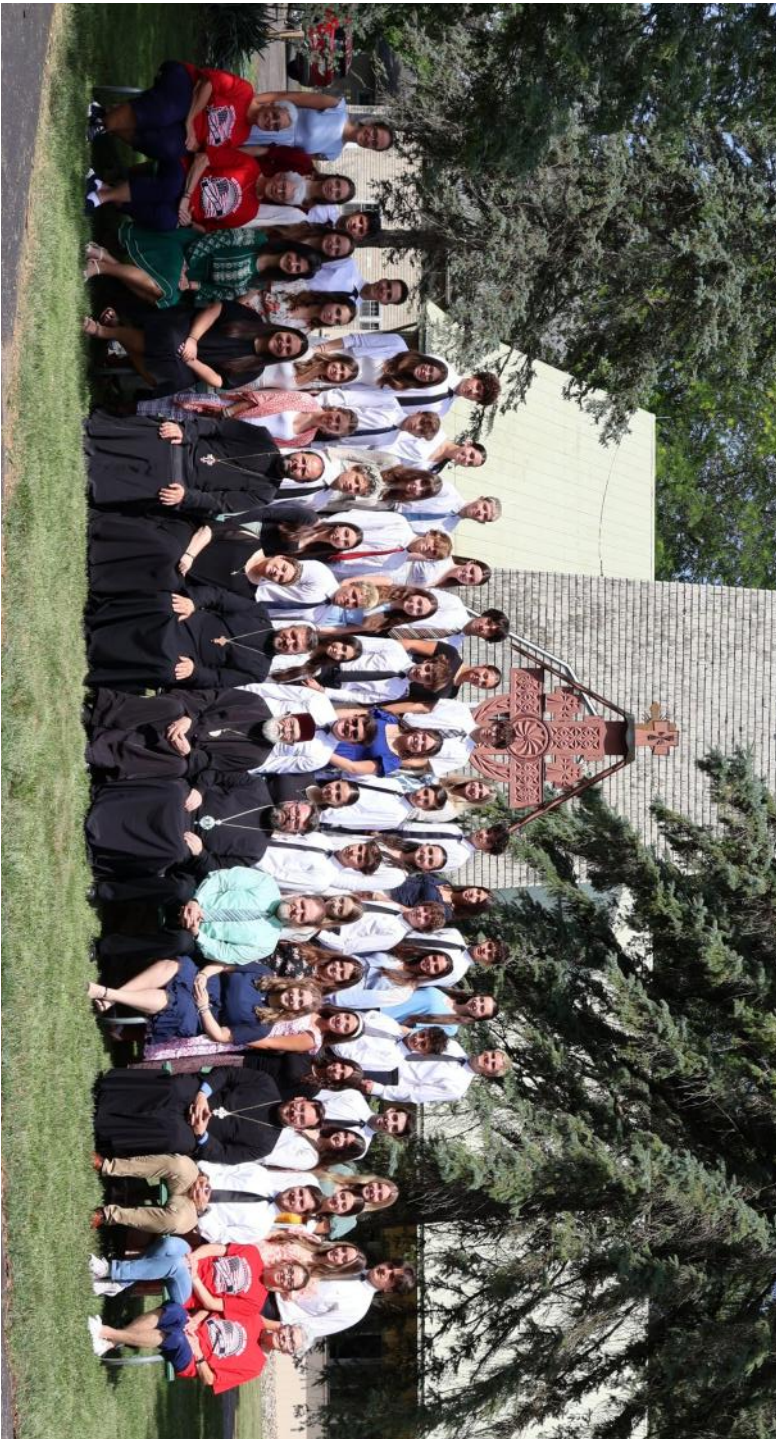
The Senior Summer Camp at Vatra Românească, Grass Lake, MI (June 29—July 12, 2025) Tabăra de Vară a Seniorilor la Vatra Românească, Grass Lake, MI (29 Iunie—12 Iulie, 2025)